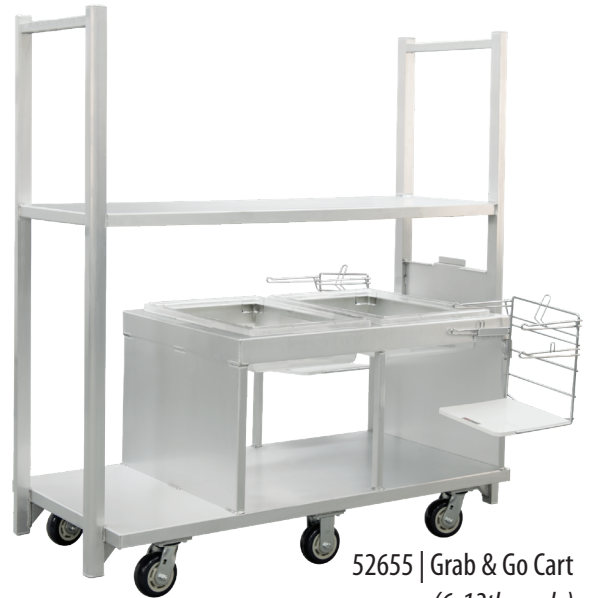
52655 | Grab & Go Cart (6-12th grade)