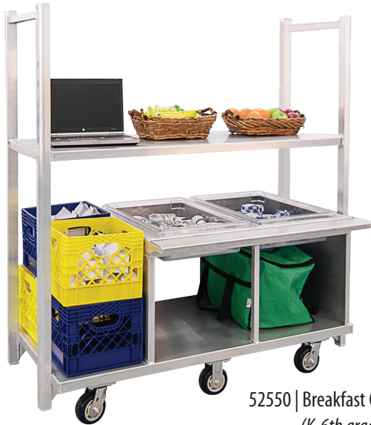
52550 | Breakfast Cart (K-6th grade)